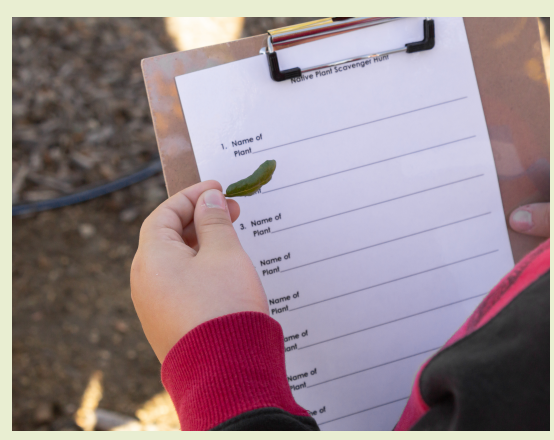
Open select Fridays & Saturdays

See website & social media for monthly calendar