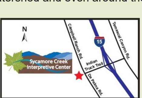
11875 Indian Truck Trail Temescal Valley, CA 92883

"I have to be a scientist to do science"; not at Sycamore Creek Interpretive Center! Everyone can be a scientist with citizen science. SCIC serves as a citizen science outpost in the Santa Ana Watershed Citizen Science Network. Help collect data and contribute to real research projects in the watershed and even around the world.