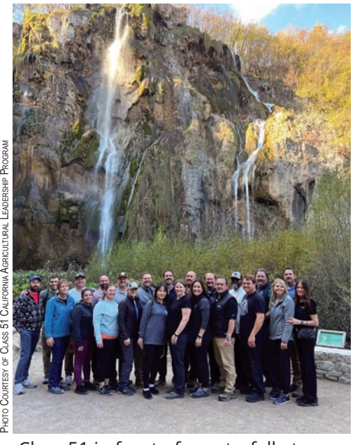
Class 51 in front of a waterfall at Plitvice Lakes National Park, Croatia

More at: https://www.youtube.com/watch?v=fNjFD2e0GM4&t=14s