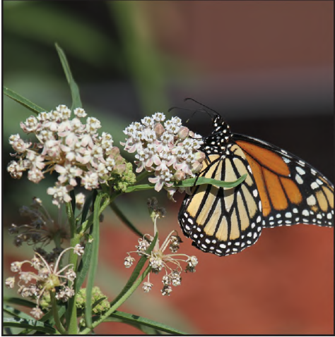
1 Narrow-leaf Milkweed Asclepias fascicularis Monarch butterfly host plant