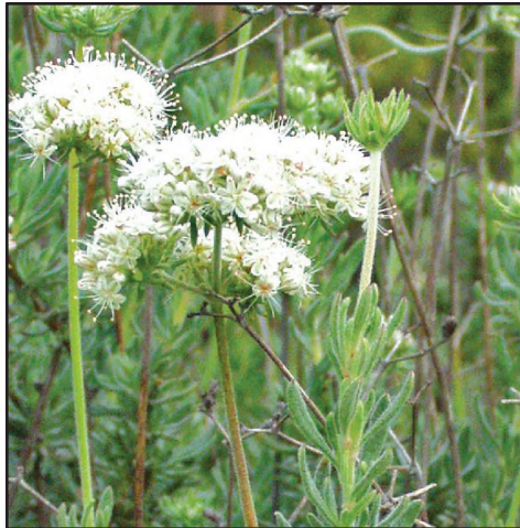
5 Eastern Mojave Buckwheat Eriogonum fasciculatum var. foliolosum