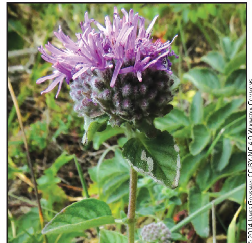
9 Coyote Mint Monardella villosa 'Russian River'