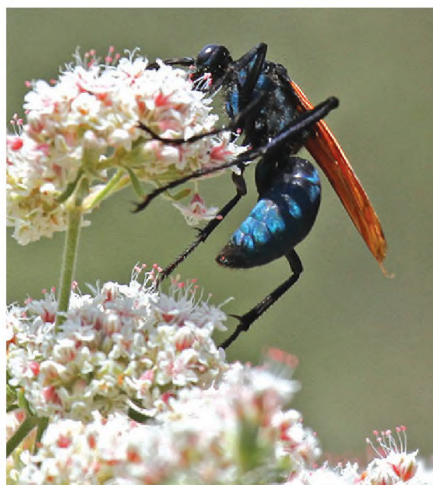
Tarantula Hawk pollinating a Buckwheat plant.

Native plants are accustomed to growing with winter and spring rains, so group plants according to similar watering needs. Some native plants will die if given too much irrigation during their dormancy during hot, dry summers.