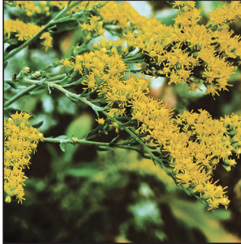
2 California Goldenrod Solidago velutina ssp. californica