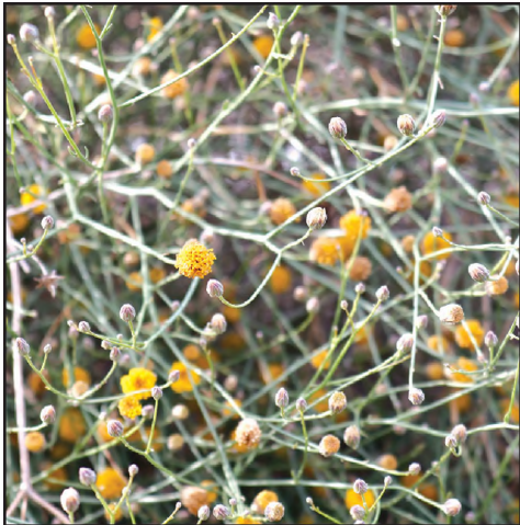
4 Sweetbush Bebbia juncea