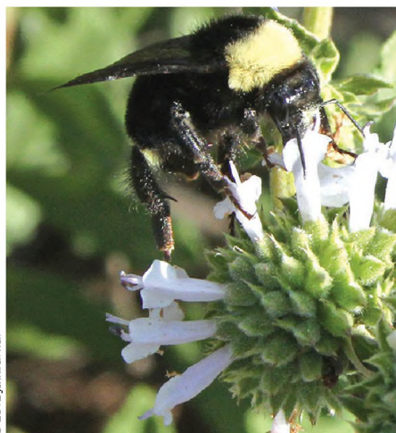
Bumblebee on a Black Sage flower