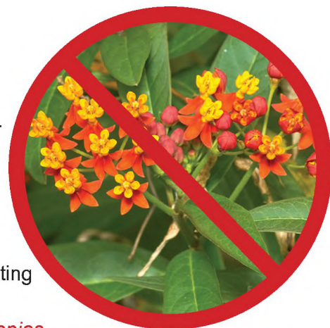
Tropical Milkweed Asclepias curassavica

Pollinators have evolved with native plants that are best adapted to the local growing season, climate, and soils. Most pollinators feed on specific plant types and species: hummingbirds sip nutrient-rich nectar from long, tubular flowers, while butterflies need smaller, more open-faced blooms.