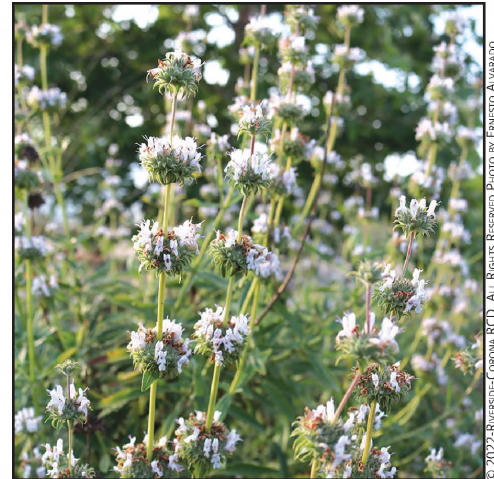
6 Black Sage Salvia mellifera