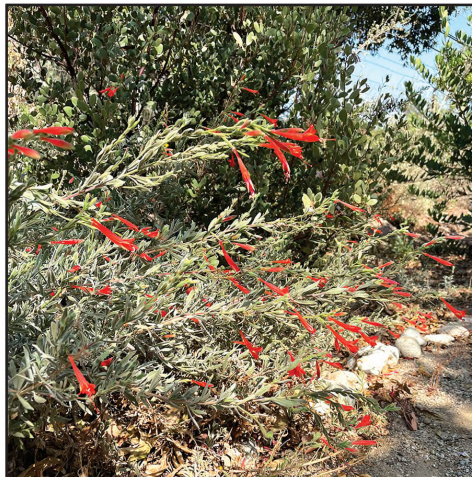
8 California Fuchsia Epilobium canum ssp. canum