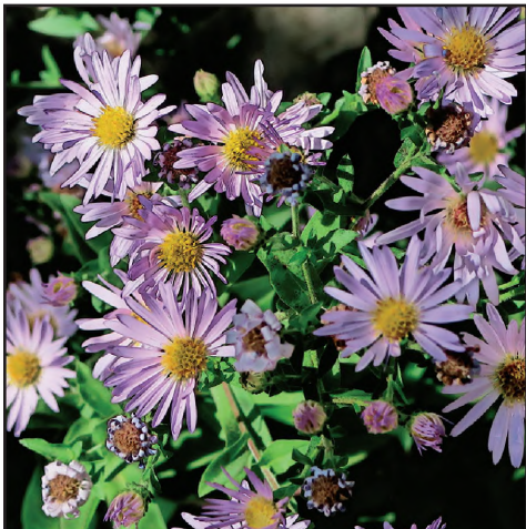
7 California Aster Symphotrichum chilense