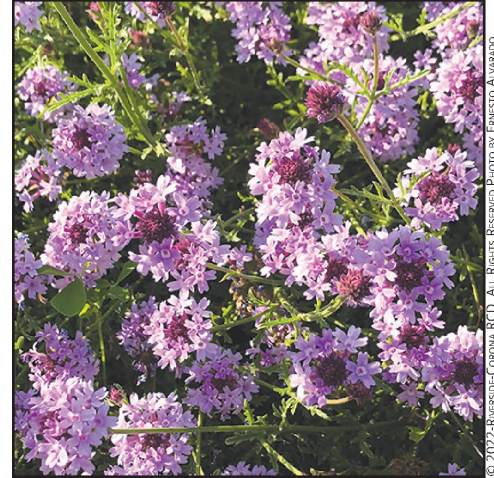
3 Verbena 'De La Mina' Verbena lilacina