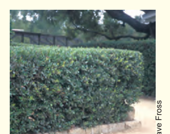
Lemonadeberry (Rhus integrifolia)

All of the above-mentioned choices are appropriate for informal hedges. The columnar or narrow habit and garden tolerance of Pacific wax myrtle, toyon, and mountain mahogany make them suitable for smaller gardens common to urban areas. If the garden soil is even moderately well drained, an additional range of California natives can be considered. Many upright cultivars* in the nursery trade make excellent natural screens with minimal pruning. California lilac (Ceanothus), alone offers a bewildering range of choices; fast growing