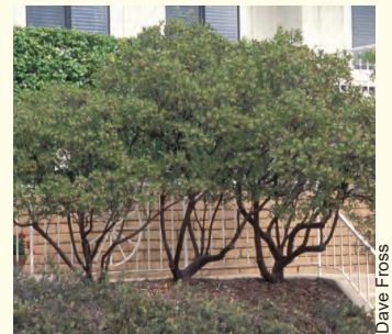
Manzanita ( Arctostaphylos 'Austin Griffiths')

and longer-lived selections include Ceanothus 'Ray Hartman', Ceanothus arboreus 'Cliff Schmidt', and Ceanothus thyrsiflorus 'Snow Flurry'. Manzanitas, Arctostaphylos species, such as Arctostaphylos bakeri 'Louis Edmumds', 'Hood Mountain', and 'Austin Griffiths' could be used in combination to create a striking eight to twelve foot screen, but regular pruning is not recommended.