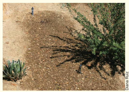
Is your water getting to the plant's root zone?

Many native riparian plants will require an ongoing supply of water throughout the year. That's one of the reasons that irrigation specialists recommend grouping plants by their watering needs, or hydrozoning.