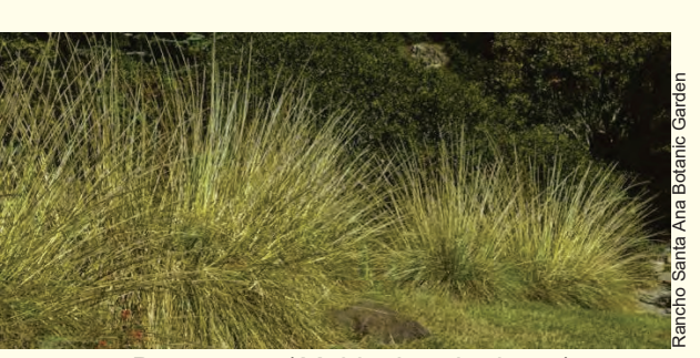
Deer grass (Muhlenbergia rigens)

Three of my favorites are warm season grasses – they grow during the summer and are dormant in winter. Deer grass ( Muhlenbergia rigens ), three foot tall and wide, has bright green blades with long, thin graceful flowering stems that sway in the breeze. Prairie dropseed ( Sporobolus airoides ), similar in size and texture to deer grass, has delicate, open, airy seed heads. Purple three-awn ( Artistida purpurea ), is slightly smaller, with an abundance of purplish fine, sharp awns that fade to a tawny gold. All three have low water requirements and can accept full sun to part shade.